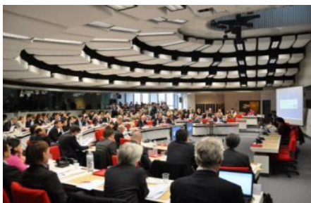
Plenary Sessions at the European Economic and Social Committee

GGS and its InBev-Baillet Latour EU-China Chair organized with a number of partners a highly successful conference on China, the EU and the Restructuring of Global Governance on 6-7 May at the European Economic and Social Committee in Brussels. The conference marked the 35th anniversary of EU-China diplomatic relations. Together with more than 250 participants, Chinese and European officials, academics and practitioners analyzed the approaches of China and the EU to multilateralism and the restructuring of global governance in the light of challenges like the economic and financial crisis, climate change, energy security and new security threats.