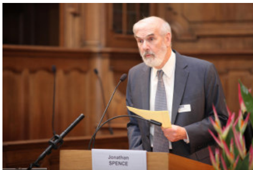
Prof. Dr. Jonathan Spence