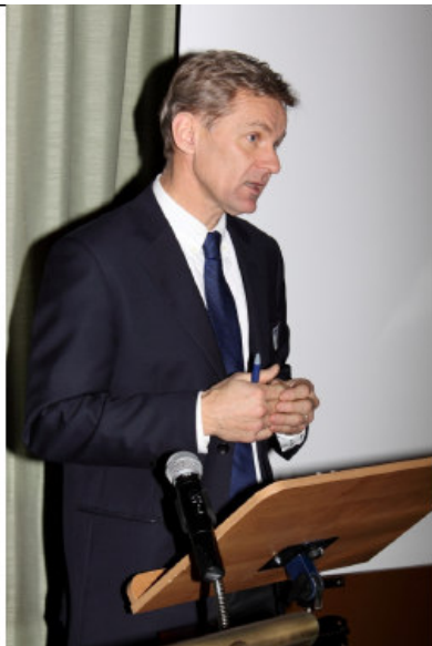
Mr. Jan Egeland