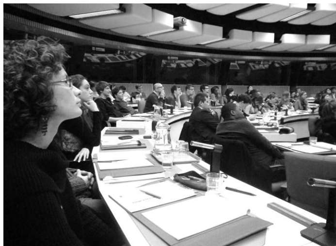
MAES Students during their visit to the European Commission in December 2011.

Organized together with the PECS programme, MEPP students were invited to join a study trip to NATO in Brussels on the 18 November 2011. The visit to the transatlantic security and defence organization provided useful information on the current transformation of NATO as much as its current global involvement. On 8 December 2011, all European Studies’ students visited the European Commission and the current exhibition “Terra Brasilis” in Brussels. Both events fitted perfectly into the interdisciplinary character of the programme. First, at the European Commission students received first-hand information on the current sovereign-debt crisis as much as on the European Neighbourhood Policy and the Commission’s activity in the field of European cultural policy. Second, the exhibition “Terra Brasilis”, which is shown in the framework of the cultural framework “Europalis” focusing on Brazil, provided students with a historical perspective on European cultural explorations in Brazil as much as the interconnectivities between Europe and South-America over time.