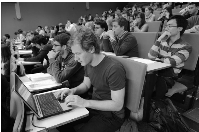
European Studies’ students during a lecture in November 2011.

While most of the students do come from EU member states, an increasing number of students previously studied in the UK, the USA or Canada. In general, more international students than before tend to enroll in the “European Studies” -programme after having studied in a country, which was not their country of origin either. As in years before, students come from many academic backgrounds adding a strong notion of interdisciplinarity to the international master programme.